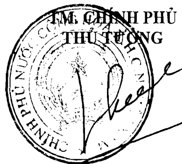
Nguyễn Xuân Phúc